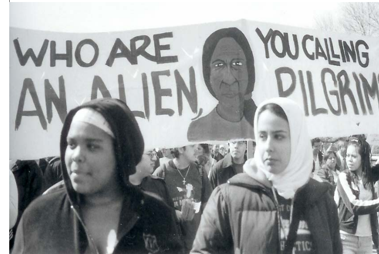
Participants from the March 10, 2006 Chicago rally for immigrant rights.

May Day, International Workers day began in 1886 when immigrant workers struggled to legalize an eight hour workday. Since the 1860s, workers worked hard to get an eight hour workday while they were forced to work long hours with no benefits. Unions and labor organizations began organizing to pass this law.